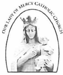
Love Christ...Live Christ

748 Roswell Rd, SW PO Box 155 Carrollton, OH 44615 info@olmcarrollton.org 330-627-4664